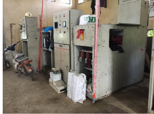
Shwe Pauk Kan Substation