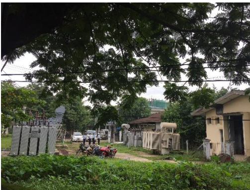
North Okkalapa Substation