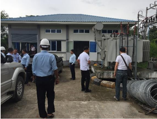
Wai Bar Gi Substation