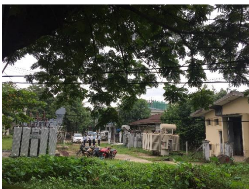
North Okkalapa Substation