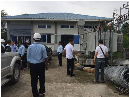
Wai Bar Gi Substation