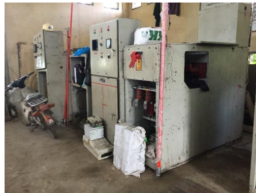
Shwe Pauk Kan Substation